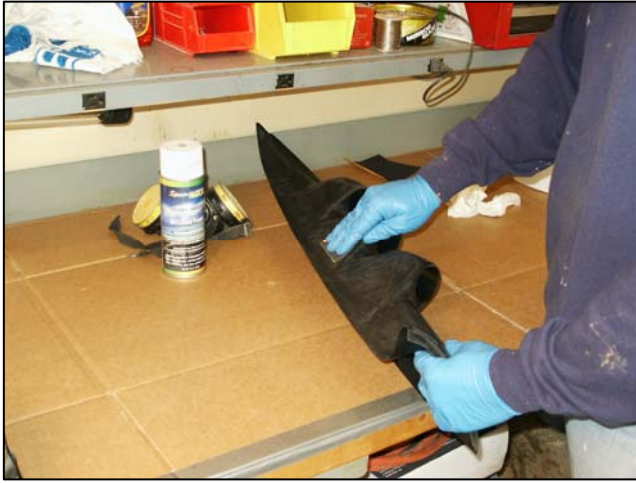
Figure 3) Sand in a small circular motion