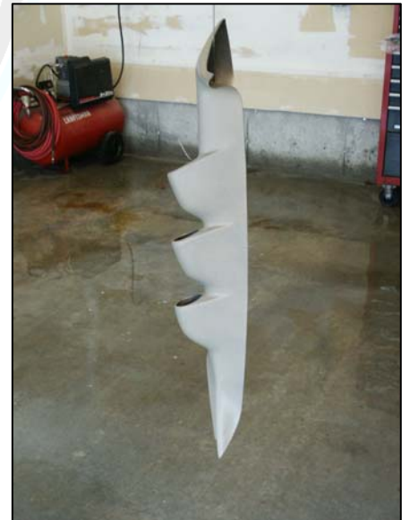
Figure 8) After the third coat

Taking the Mystery out of Diesel Performance™