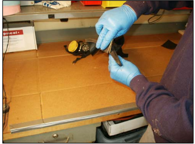
Figure 4) Remove any sharp edges or flashing