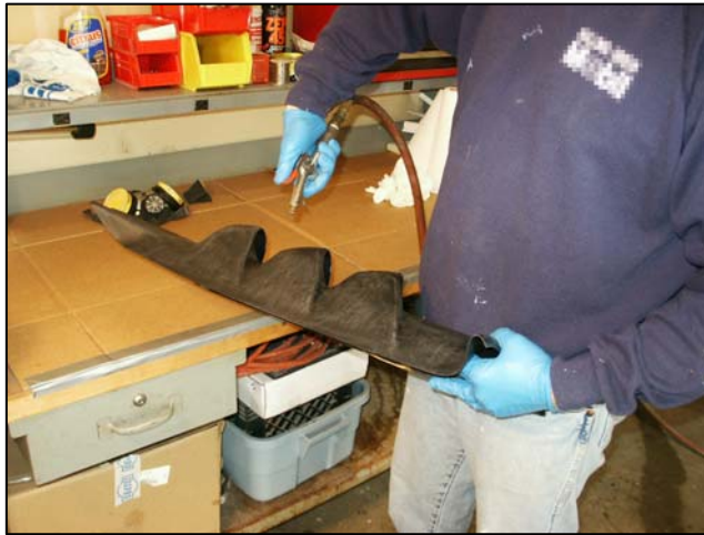
Figure 5) Blow off with compressed air