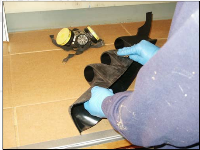
Figure 2) Sand all surfaces to receive paint with 220 grit paper

Taking the Mystery out of Diesel Performance™