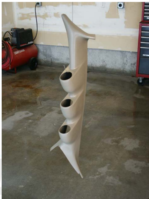
Figure 10) Let dry