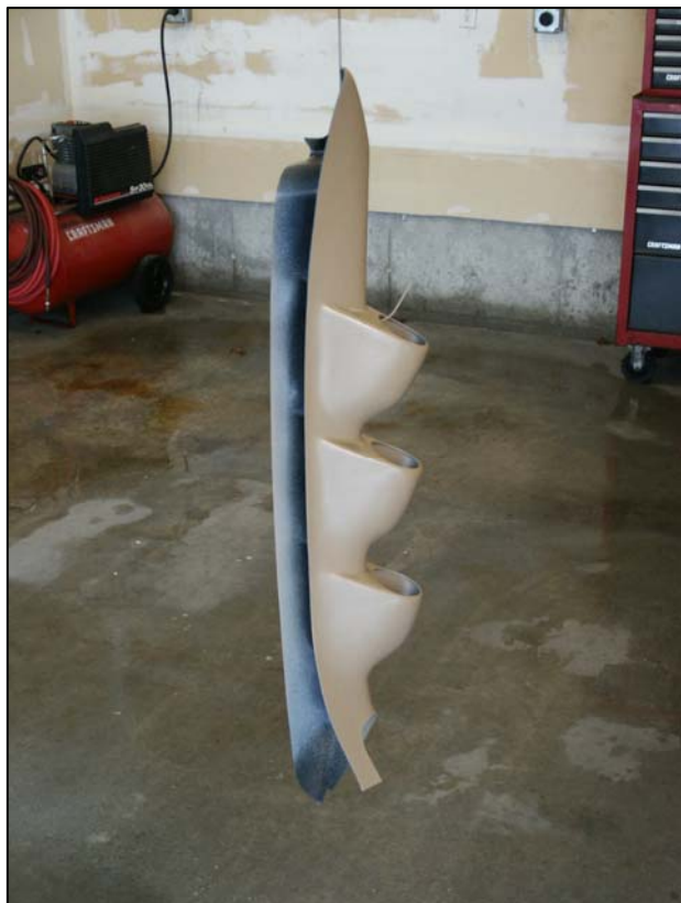
Figure 9) After the fifth coat