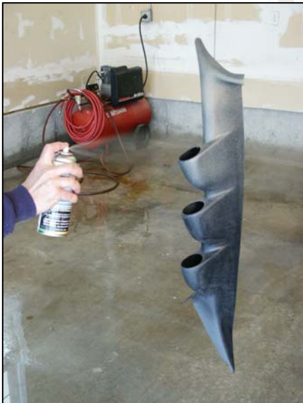
Figure 6) Applying the paint