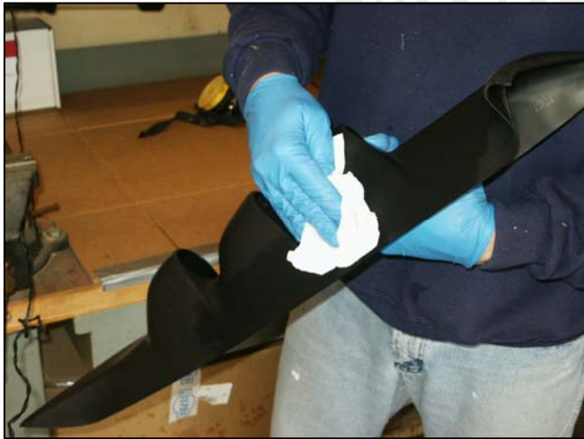
Figure 1) Cleaning with degreaser, wiping in one direction

SpectraMatch paint is available from DieselManor ( www.dieselmanor.com ) in most popular diesel truck A-pillar colors.