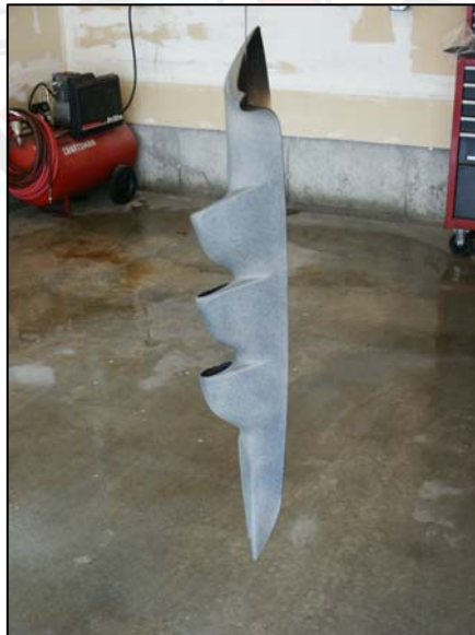
Figure 7) After the first coat